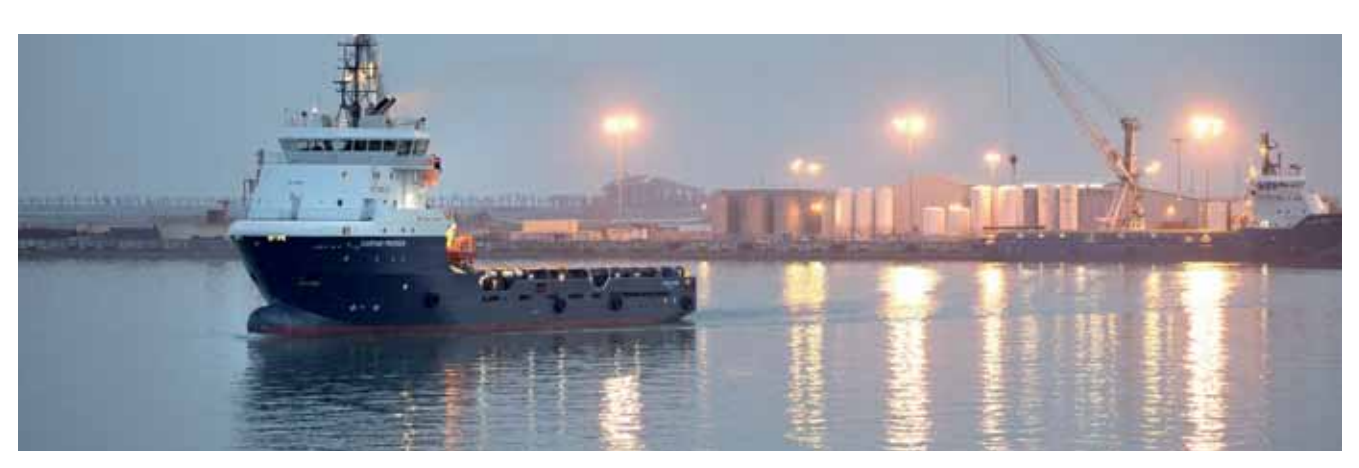
Transport boat off to Absheron platform, Baku, Azerbaijan.

As a consequence, the Board of Directors decided not to approve this resolution.