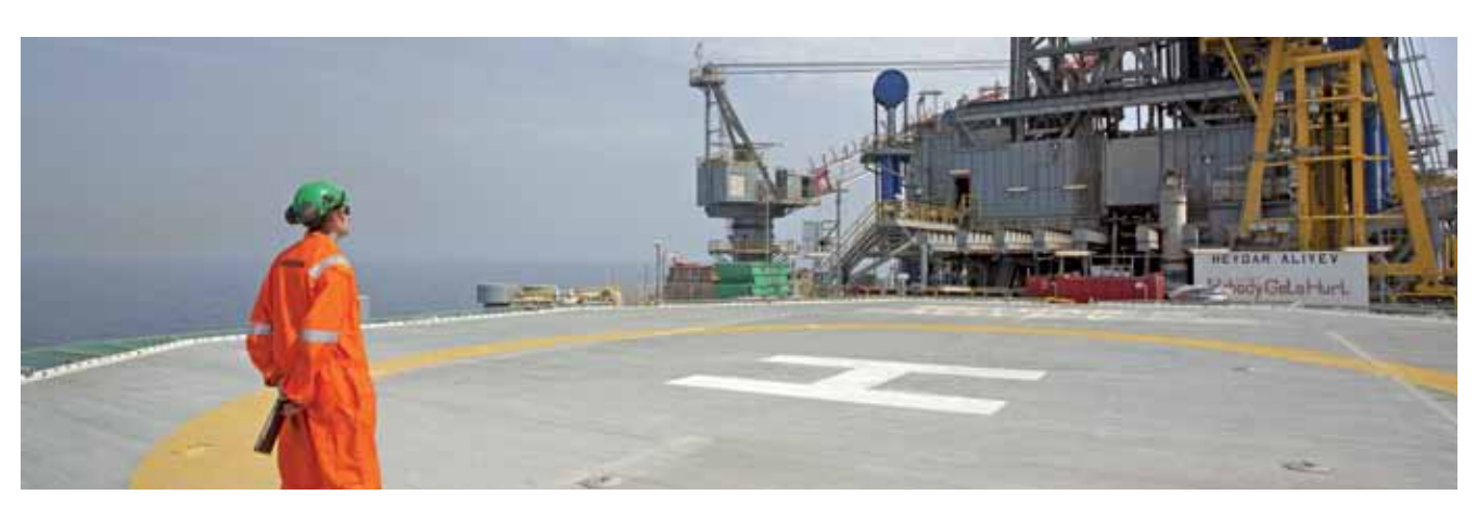
Absheron platform, Baku, Azerbaijan.

The options granted on the basis of this authorization may not grant the right to subscribe or purchase a number of shares that exceeds 0.75% of the share capital as of the date that the Board decides to grant the options.