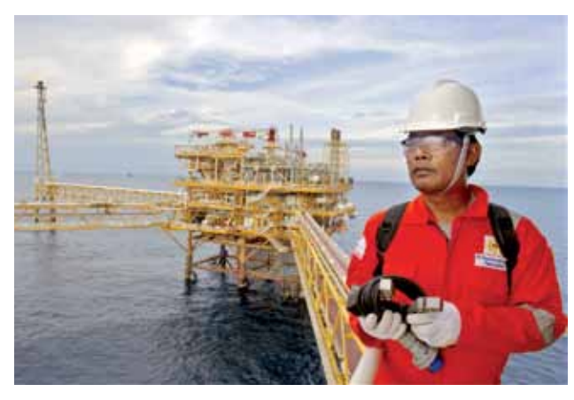
Yadana platform, Myanmar.

kets Authority (Autorité des marchés financiers, or "AMF"), and voting under the conditions of quorum and majority required for Ordinary General Meetings, the shareholders hereby authorize the Board of Directors, with the possibility to sub-delegate such authority under the terms provided for by law, pursuant to the provisions of Article L. 225-209 of the French Commercial Code, of Council Regulation n°2273/2003 dated December 22, 2003 and of the General Regulation of the AMF, to buy or sell