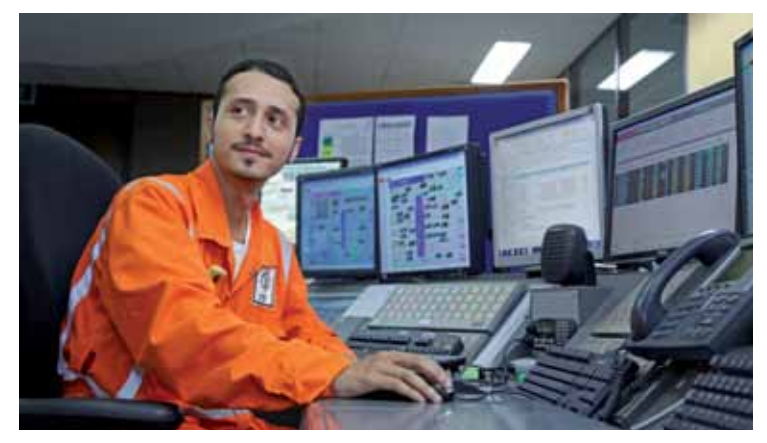
Qatargas plant, Qatar.

Your Board of Directors therefore proposes that you decide to set at 1,400,000 euros the annual maximum amount of directors' fees allocated to the Board of Directors for fiscal year 2013. If approved, this decision shall be maintained and that same global amount shall be allowed to the Board of Directors for subsequent fiscal years, until the Shareholders' Meeting adopts another decision. This decision shall supersede the decision issued by the Shareholders' Meeting on May 11, 2007, which set the maximum annual amount of directors' fees at €1,100,000, which has not been reassessed.