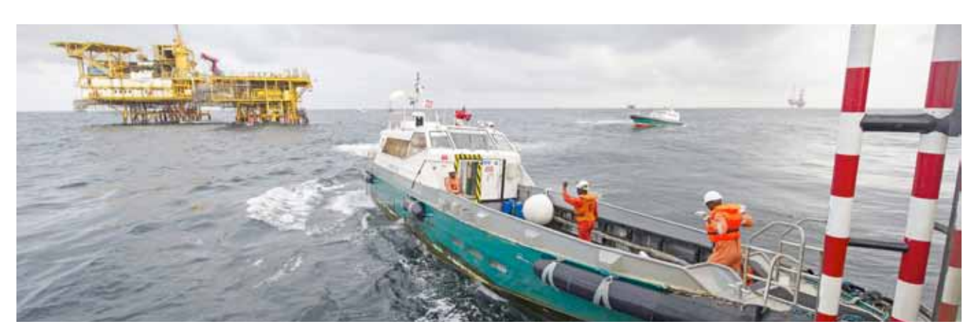
Platform off Port Gentil, Gabon.

(1) In the form of shares or shares in investment funds invested in Company securities.