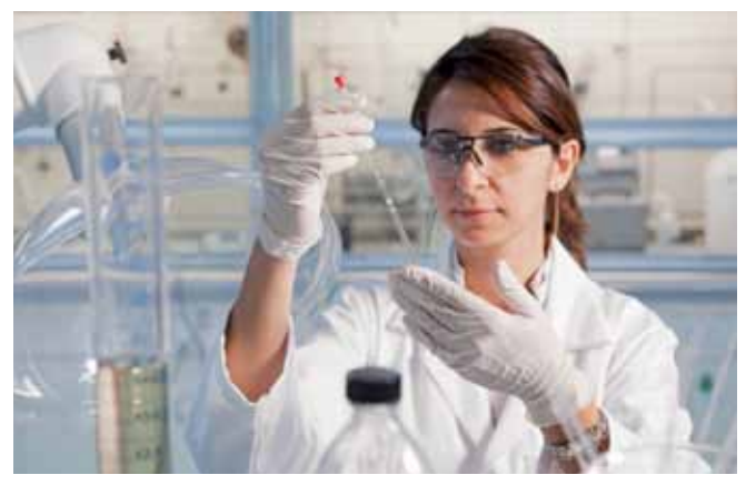
Research center in Doha, Qatar.