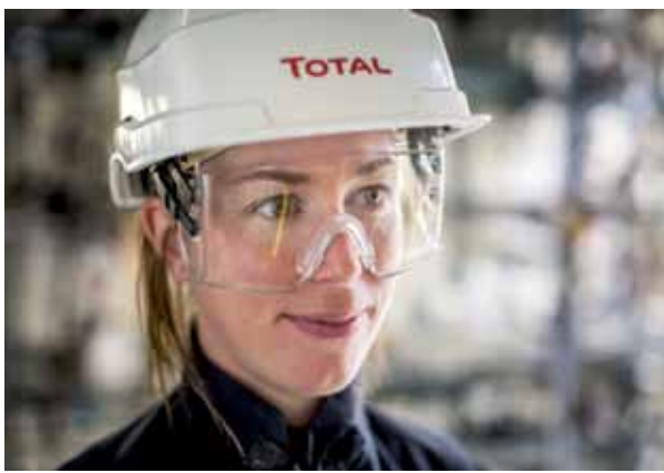
Normandy refinery, France.