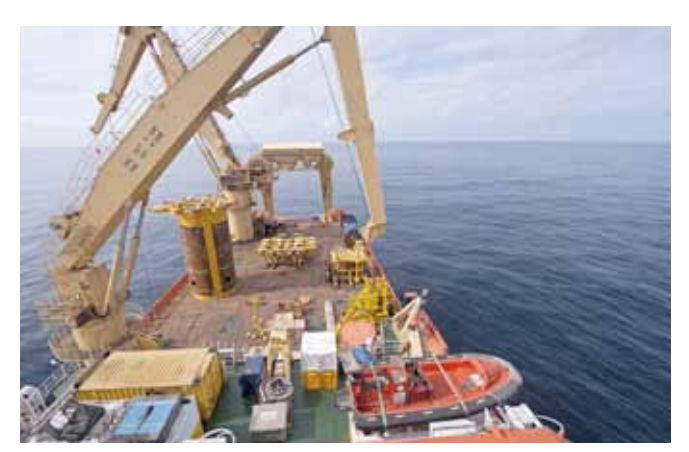
Normand Installer boat, off Lobito, Angola.

This delegation is granted to the Board of Directors for a period of twenty-six months from the date of this Shareholders' Meeting. It renders ineffective up to unused amounts the seventeenth resolution of the Combined Shareholders' Meeting held on May 11, 2012.