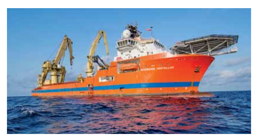
The Normand Installer boat, off Lobito, Angola.

Freedom of expression within the company promotes progress and that is true in every area, including technical and ethical areas. An oil company with professionals at the international level that deals with technical and scientific issues at the cutting edge of available technologies, cannot tolerate self-regulation by its employees with respect to both ethical issues and technical issues, which might be motivated by the fear of reprisals or displeasing those who think otherwise, at the risk of losing opportunities or making errors of judgment and assessment that could at times be tragic for the TOTAL Group, which has a presence in countries where there may be corruption and which is often exposed to complex situations and pressures. It must have a strong, independent, and credible Ethics Committee, which all employees or executives may look to in complete confidence and without fear.