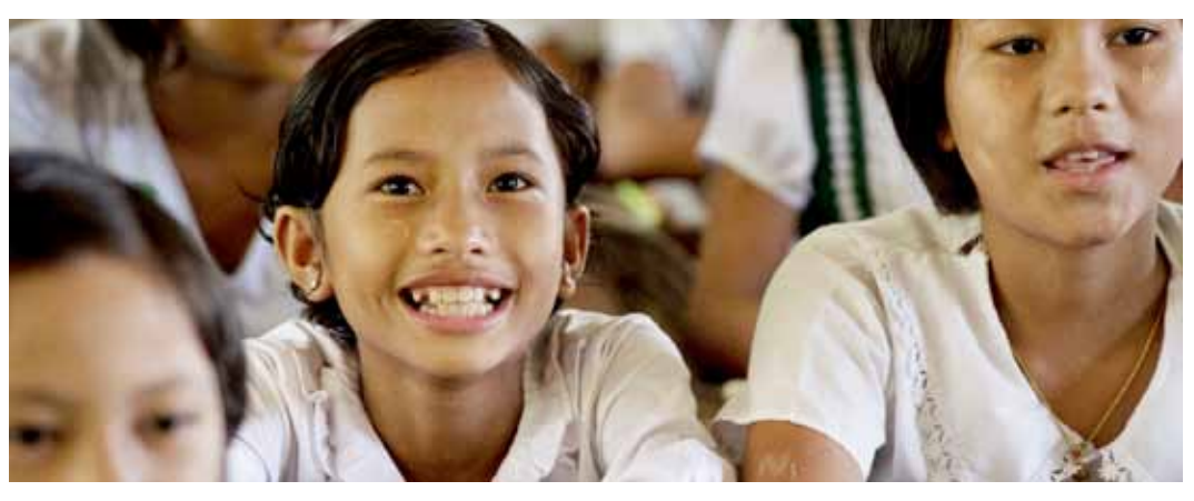
Pulpils attending the "Yadana Tuition" schooling program, Myanmar.

The focus on indicators, especially if they prove not to be the most relevant, may distract attention from major industrial risks. Furthermore, linking economic or financial incentives to achieving security results may actually distort indicators and produce the opposite result by providing a sense of false security, as has been lucidly pointed out by OSHA (the Federal Occupational Safety and Health Administration in the US).