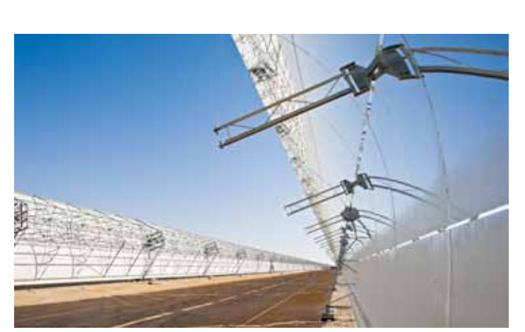
Solar power plant in Madinat Zayed, United Arab Emirates.