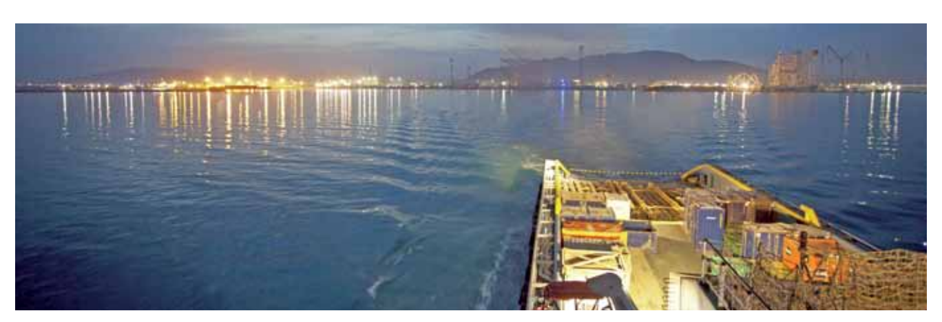
Port of Baku, Azerbaijan.

Pursuant to the provisions of Article L. 225-209 of the French Commercial Code, the maximum number of shares that can