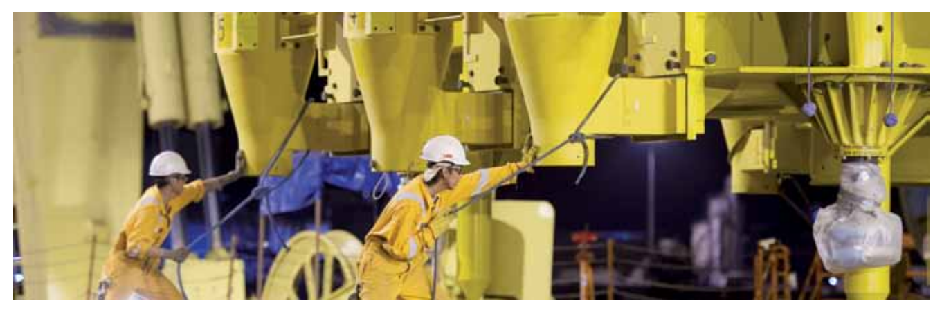
Sonamet yard, Lobito, Angola.