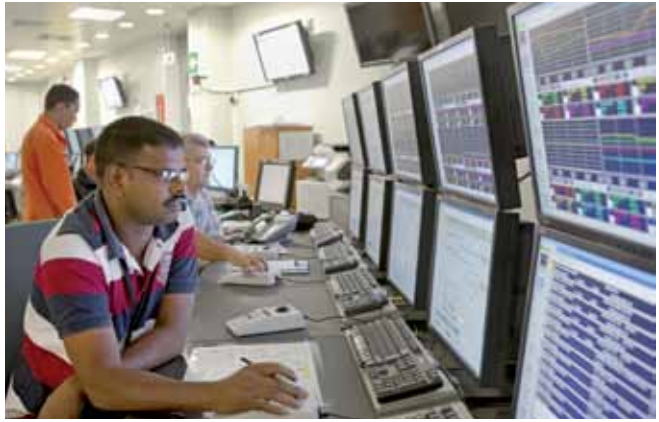
Treatment plant of Bolashak, Kazakhstan.