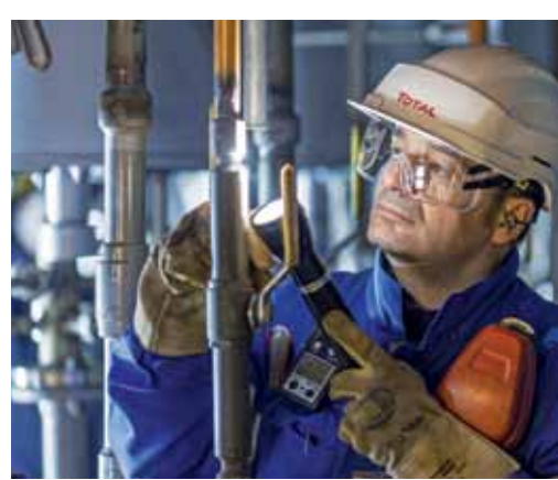
Normandy refinery in Harfleur, France.