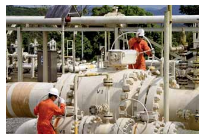
Gas processing plant, Myanmar.

(1) FASB Accounting Standards Codification Topic 932, Extractive industries - Oil and Gas.